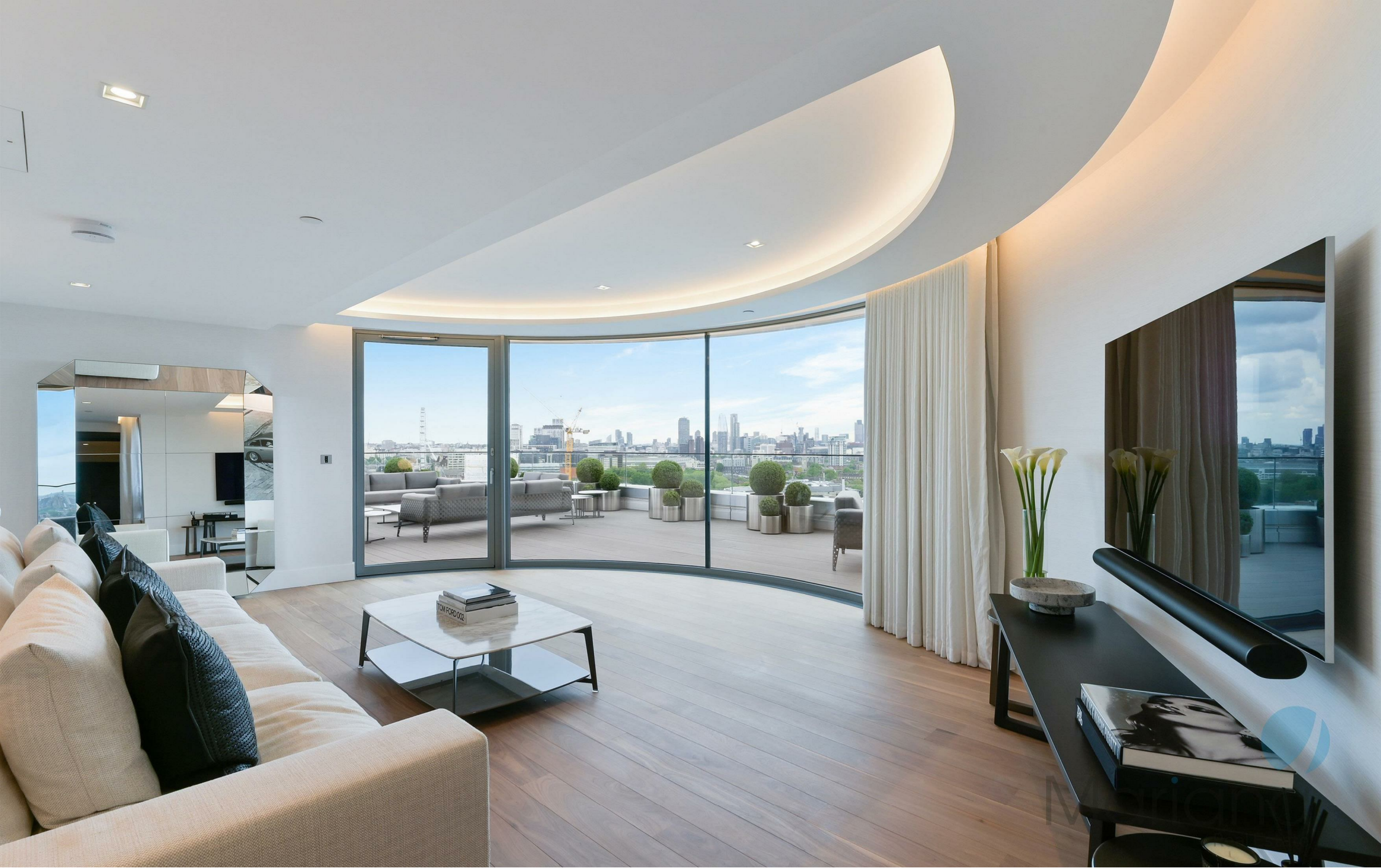
71 The Corniche London, SE1 7GG £3,500 Per Week